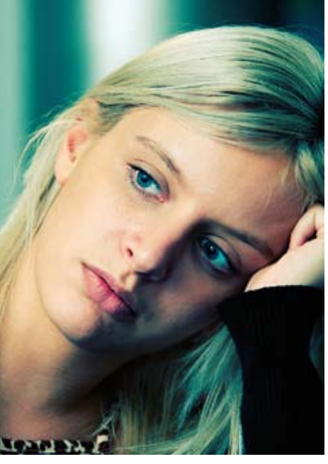
Support is available