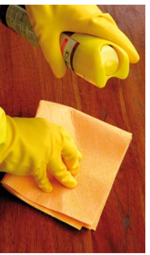
Clean after a fire