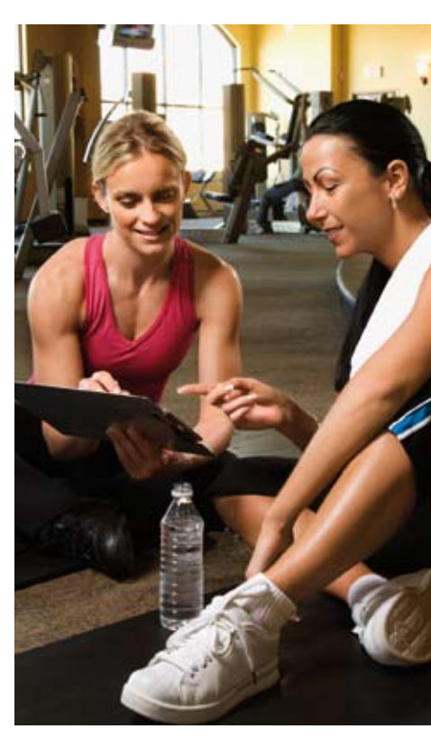
Try to do a little exercise every day