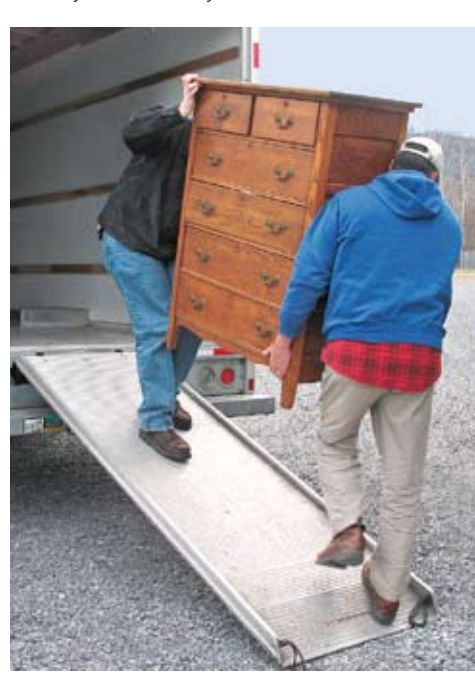
Seek help to relocate