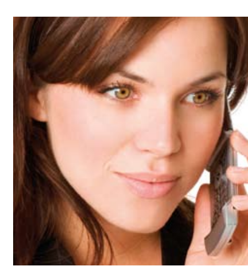
Who needs to be notified?

Hint: You may wish to note the name of the person you spoke to and the date for future reference. ☐ Your employer Details: ☐ Family and friends Details: Your children's schools Details: Post Office – to hold or forward your mail Details: Delivery services – such as newspapers and milk Details: Utility companies – such as Telstra, the local council Details: The Police – if the fire is under investigation Details: Insurance Company Details: