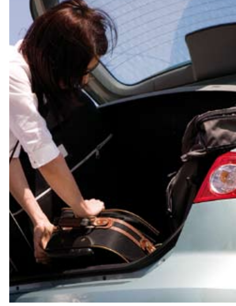
You may have to leave your home

If you are in need of urgent or crisis accommodation, check with the local family welfare organisations that may be able to assist in finding temporary housing. (See back cover, or see Yellow Pages: Organisations – Family Welfare).