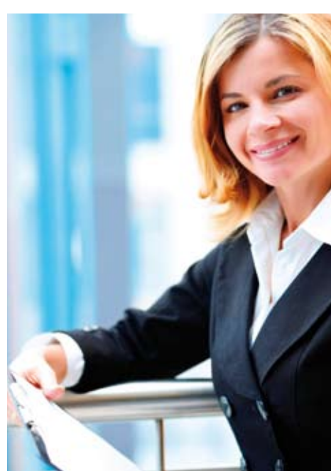
Insurance assessor contact details