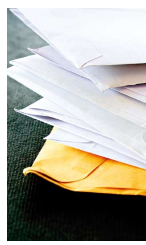
Redirect your mail