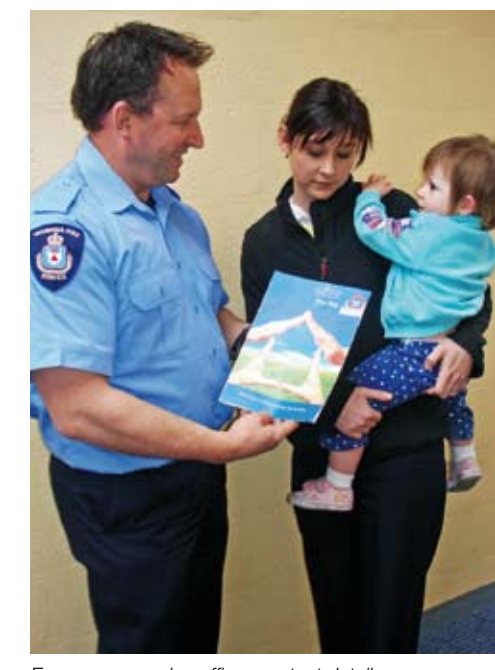
Emergency service officer contact details

community fire safety on freecall 1800 000 699