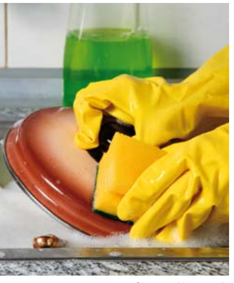
Clean cooking utensils