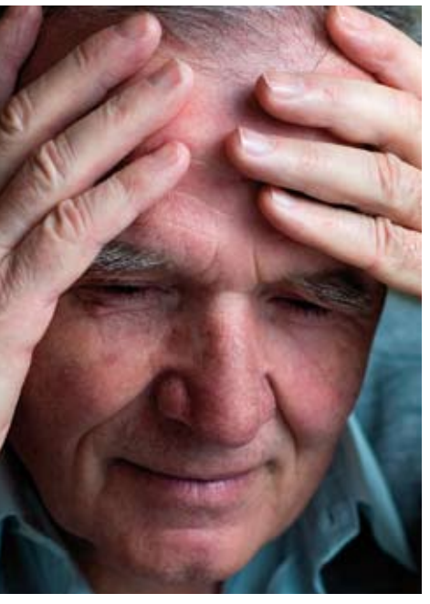
How are you coping?