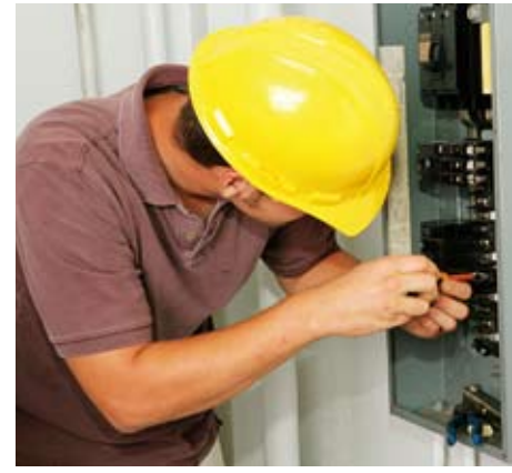
Use qualified tradespersons

Discard any food, beverages, or medicines exposed to heat, smoke or water damage. Refrigerators and freezers left unopened will hold their temperature for a short time, but do not re-freeze frozen food that may have thawed during the incident.