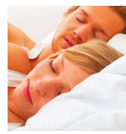
Get plenty of rest

Lifeline (13 11 14) provides confidential 24-hour counselling, support and referral.